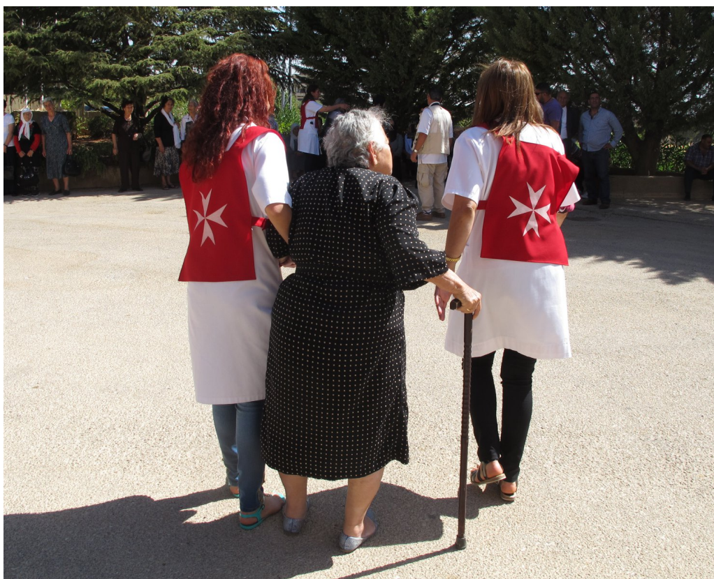
Upholding human dignity by reaching out to the excluded, such as the elderly

Moreover, it will be providing basic medical assistance to the elderly hosted at the center.