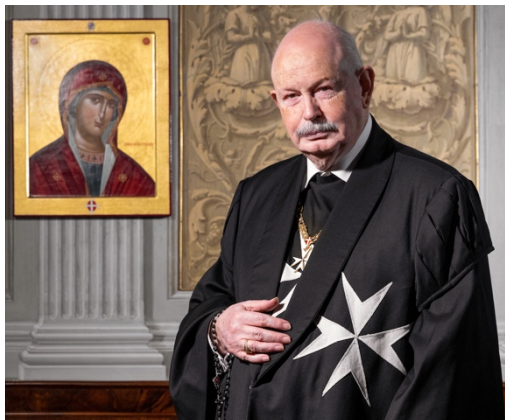
80° Grand Master Fra' Giacomo Dalla Torre del Tempio di Sanguinetto

Cooperation and constructive dialogue based on the principles of respect of human dignity are the fundamental pillars to build a strategy for the future.