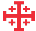
ORDINE EQUESTRE DEL SANTO SEPOLCRO DI GERUSALEMME