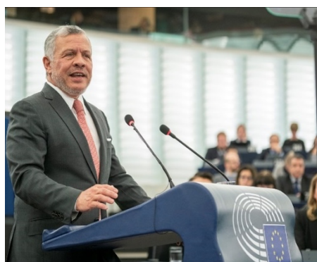
His Majesty King Abdullah II

[...] Because we all have a responsibility to safeguard our people’s long-term interests and welfare. [...] My father, the late king Hussein, taught me that peace making is always the harder but the higher path. “